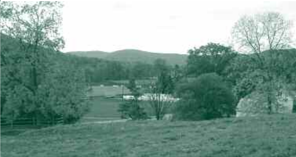
View over Bel Park Farm toward the Susquehanna River

Most of all, our thanks to the award winners, whose achievements are manifest in the beauty of what they care for. As they spoke from the podium, simply and from the heart, each told the same story in different words: "We all care about the same things. We do this purely for the love of our land."