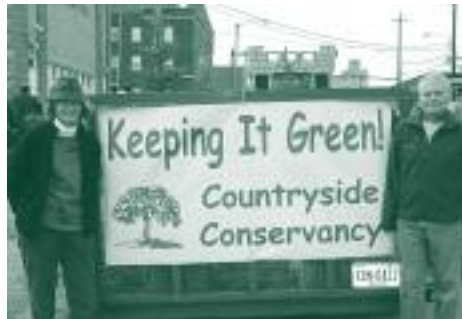
Amy Broadbent and Curt Bogart just before parade step-off.

We thank them, and all the Conservancy friends who wore the green and marched with us in the big parade!