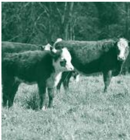
Cattle at Clodhopper Farm.