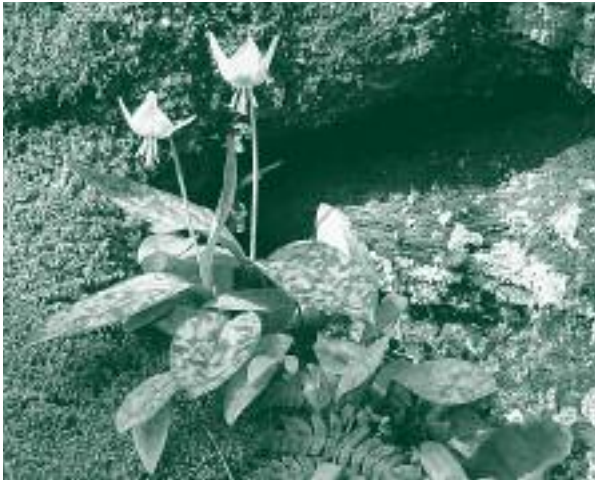
Trout Lily.

The South Branch Watershed Coalition stayed busy over the winter months with a full program of free educational events for the public. The season kicked off on February 5 with a slideshow on Wildflowers of Northeast Pennsylvania, presented by Gerry Janus. The slides by Gerry and Len Janus were outstanding, and Gerry's knowledge of the natural history of these beautiful plants was both scientifically comprehensive and highly entertaining!