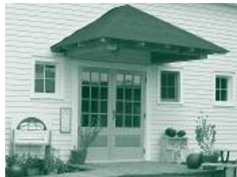
The Summerhouse Grill, Montrose.

In an interesting tie-in, we learned that 2007 Award winner Summerhouse Grill is supplied by 2007 Award winners