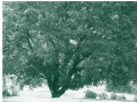
A spreading shade tree at the Waverly Country Club.