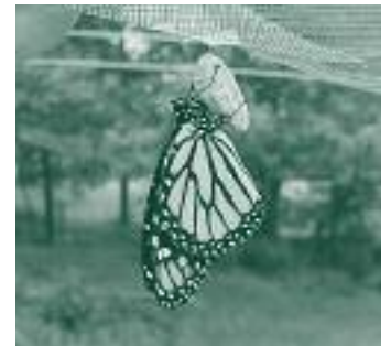
Newly hatched Monarch Butterfly.