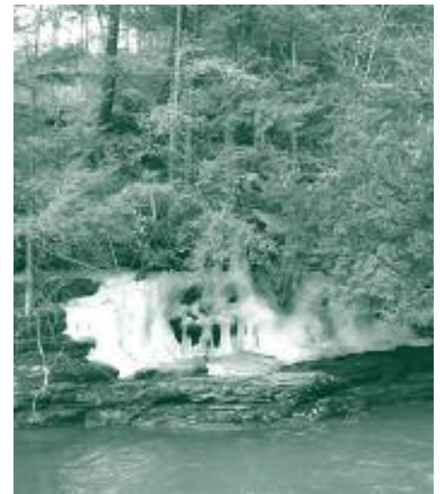
By April most of the gorge was clear of ice, but this ice-face was still grinning across the creek!

Architect Jim Rogers has produced a simple but beautiful design for a picnic shelter to be built at the Glen. We plan to move ahead with construction this summer. The picnic shelter is being created with the help of a grant from the Lackawanna Heritage Valley Authority. Plans are also underway to create a safe off-road parking area for the Glen with support from the Endless Mountains Heritage Region, and to better mark trails on the property to minimize the risk of erosion by uncontrolled tramping up and down the fragile banks of the creek.