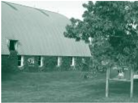
Ivy-covered barn at Everitt's Vue.

Clodhopper Farm and Skoloff Valley Organic Farm, among other local farms! The Summerhouse Grill serves “contemporary bistro style fare in a comfortable and friendly setting,” and sources its ingredients from local suppliers whenever possible. The Grill also hosts periodic “Meet the Farmer” dinners to spotlight farms it works with. Visit www.summerhousegrill.com to learn more, or to make a reservation. The restaurant is open seasonally, and the 2007 grand opening is scheduled for May 3, 2007.